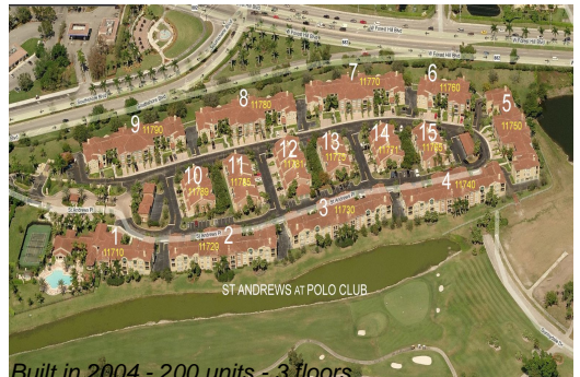
Built in 2004 - 200 units - 3 floors