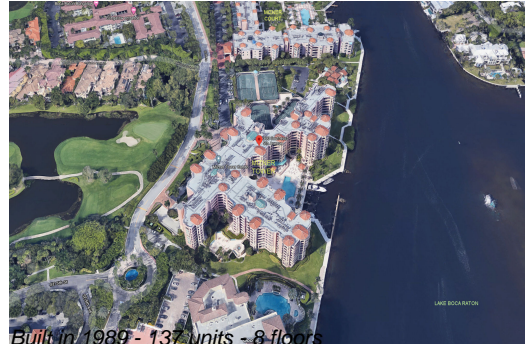
Built in 1989 - 137 units - 8 floors