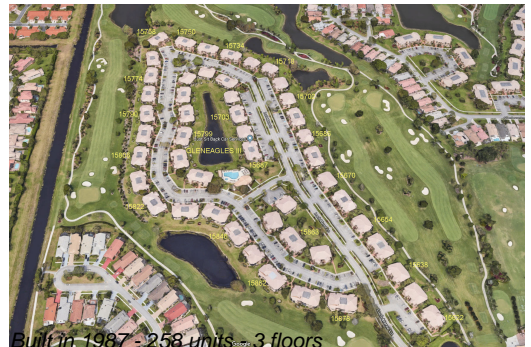
Built in 1987 - 258 units - 3 floors