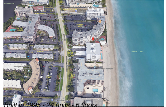
Built in 1995 - 24 units - 6 floors