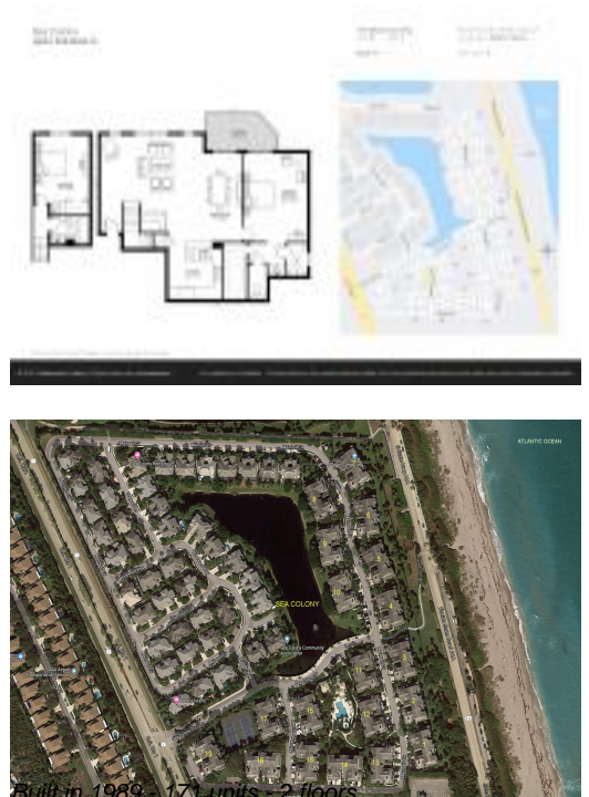
Built in 1989 - 171 units - 2 floors