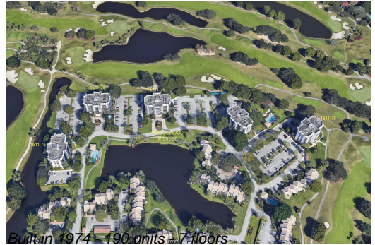
Built in 1974 - 190 units - 7 floors