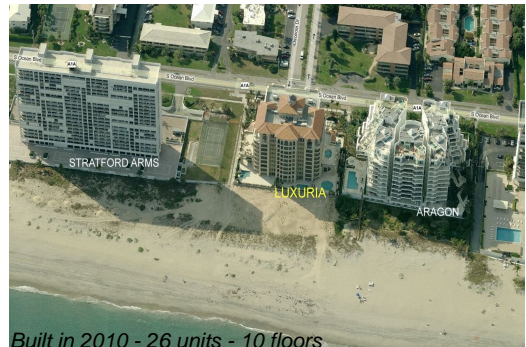
Built in 2010 - 26 units - 10 floors