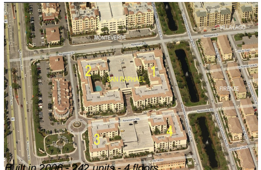
Built in 2006 - 242 units - 4 floors