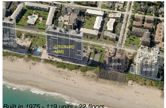
Built in 1975 - 119 units - 22 floors