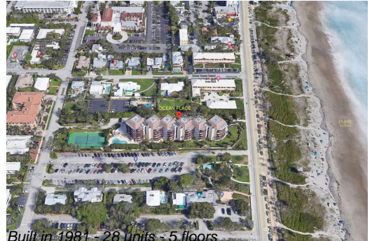
Built in 1981 - 28 units - 5 floors