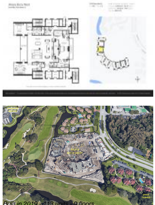
Built in 2019 - 113 units - 9 floors