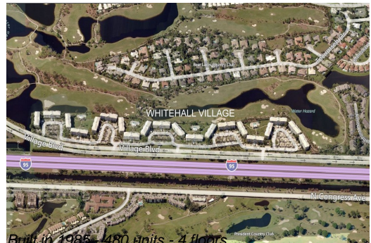
Built in 1986 - 480 units - 4 floors