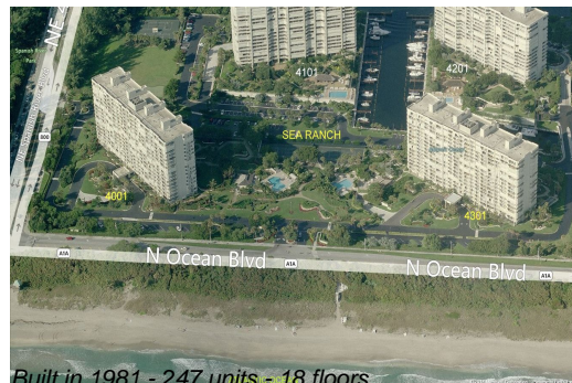
Built in 1981 - 247 units - 18 floors