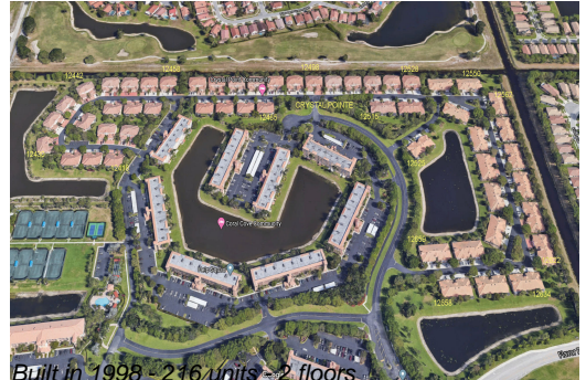
Built in 1998 - 216 units - 2 floors