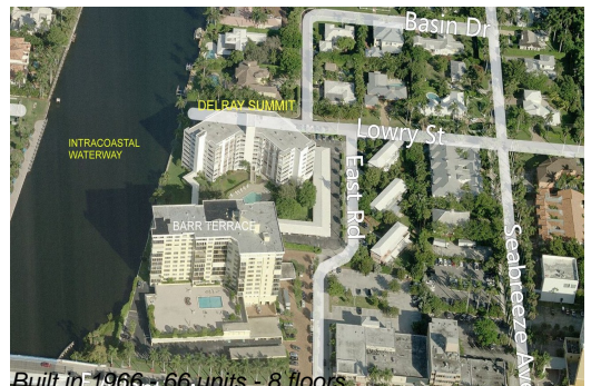
Built in 1966 - 66 units - 8 floors