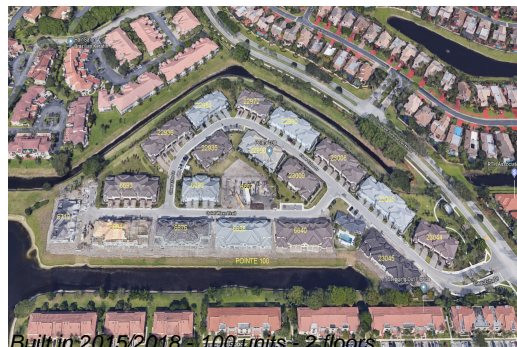
Built in 2015/2018 - 100 units - 2 floors