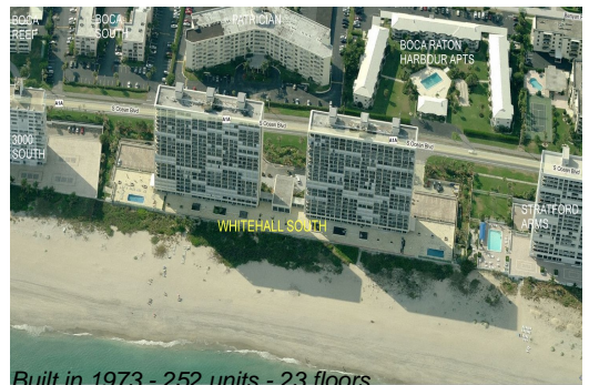
Built in 1973 - 252 units - 23 floors