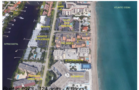
Built in 1973 - 121 units - 5 floors