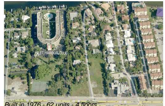
Built in 1976 - 62 units - 4 floors