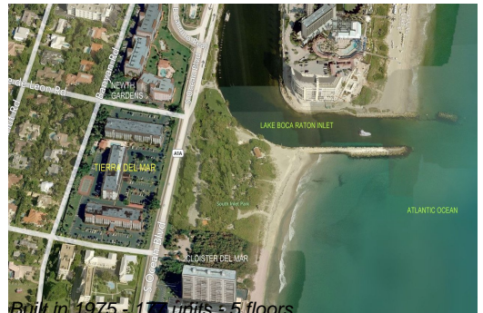
Built in 1975 - 177 units - 5 floors