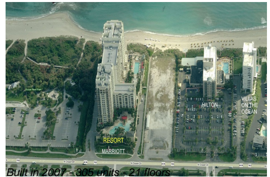
Built in 2007 - 305 units - 21 floors

The above valuated price is a baseline figure that does not take into account any specific renovation, upgrade, split, merge, or deterioration of the unit.