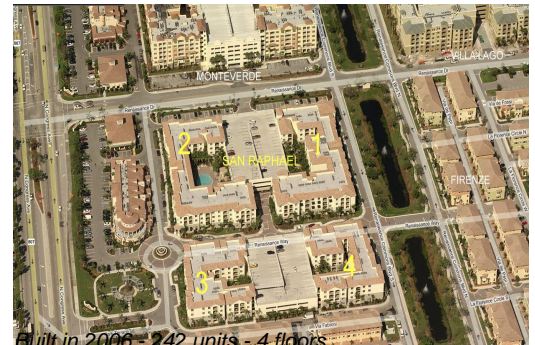
Built in 2006 - 242 units - 4 floors