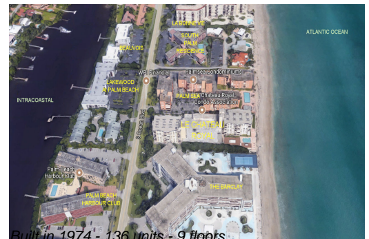
Built in 1974 - 136 units - 9 floors