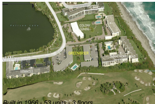
Built in 1966 - 53 units - 3 floors