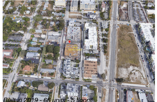
Built in 2019 - 66 units - 5 floors