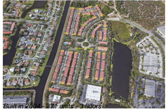
Built in 2004 - 271 units - 3 floors