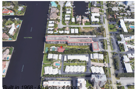
Built in 1968 - 80 units - 4 floors