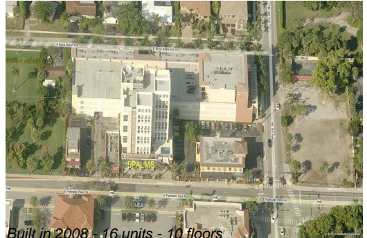
Built in 2008 - 16 units - 10 floors