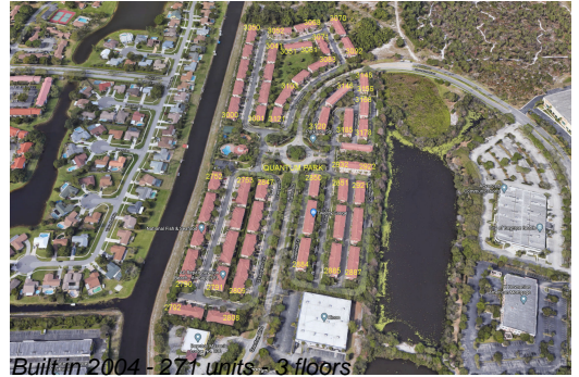
Built in 2004 - 271 units - 3 floors