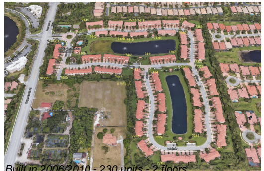
Built in 2006/2010 - 230 units - 2 floors