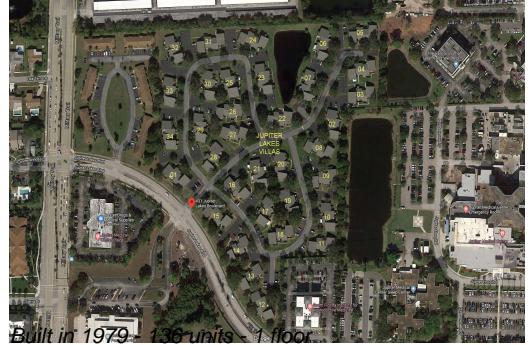
Built in 1979 - 136 units - 1 floor