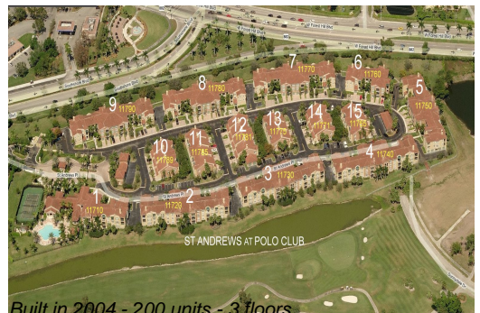
Built in 2004 - 200 units - 3 floors