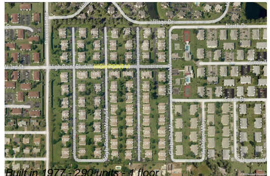
Built in 1977 = 290 units = 1 floor