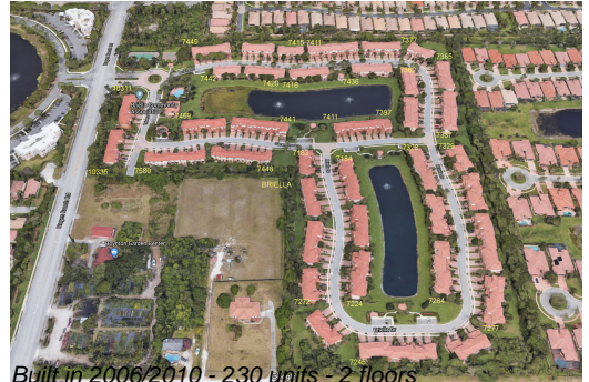
Built in 2006/2010 - 230 units - 2 floors