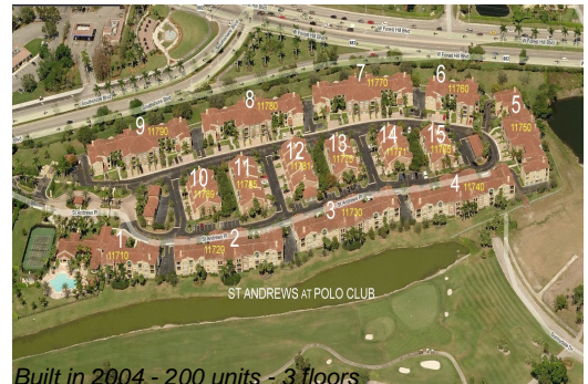
Built in 2004 - 200 units - 3 floors