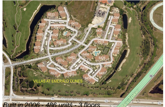
Built in 2006 - 486 units - 3 floors