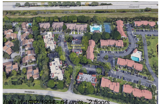
Built in 1982/1994 - 64 units - 2 floors