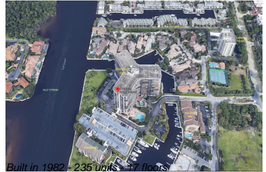
Built in 1982 - 235 units, 17 floors

The above valuated price is a baseline figure that does not take into account any specific renovation, upgrade, split, merge, or deterioration of the unit.