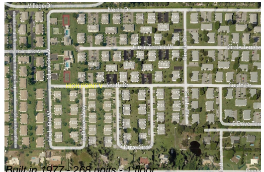
Built in 1977 - 268 units - 1 floor