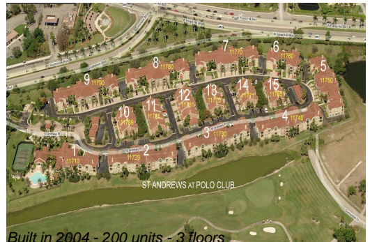
Built in 2004 - 200 units - 3 floors