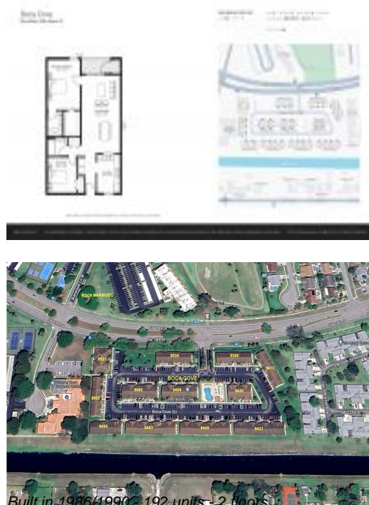
Built in 1986/1990 - 192 units - 2 floors