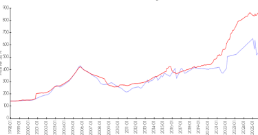
Ambassador's One South (South Tower) vs Highland Beach