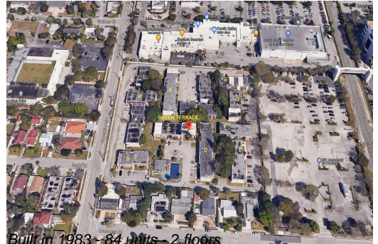
Built in 1983 - 84 units - 2 floors