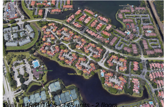
Built in 1987/1985 - 145 units - 2 floors