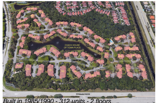
Built in 1985/1990 - 312 units - 2 floors