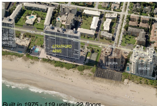
Built in 1975 - 119 units - 22 floors