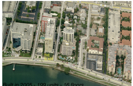
Built in 2005 - 199 units - 16 floors