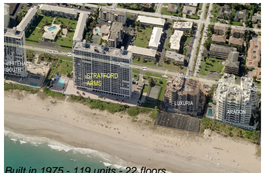
Built in 1975 - 119 units - 22 floors