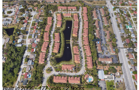
Built in 2006 - 177 units - 2 floors