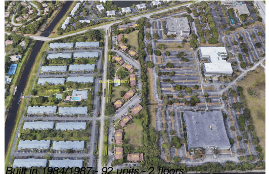
Built in 1984/1987- 92 units - 2 floors